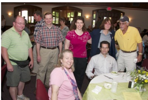
Seminole Spirit "Speech Listening" Support Group Members