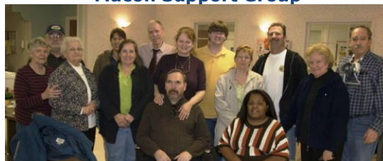
Columbus Support Group