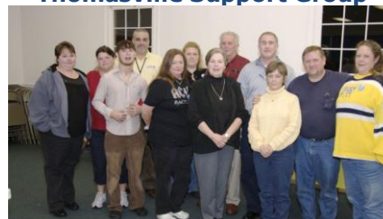
Macon Support Group

A few of the groups visited for Disability Day Promotions! Thomasville Support Group