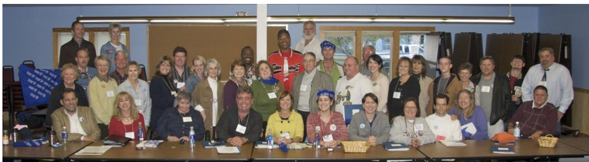
2008 BIAG LEADERSHIP SUMMIT ATTENDEES