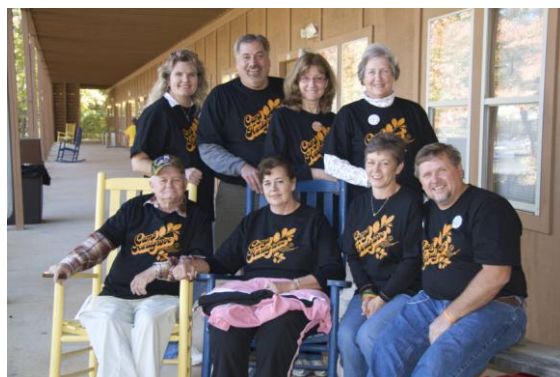
2008 CAMP HARDGROVE CAREGIVERS