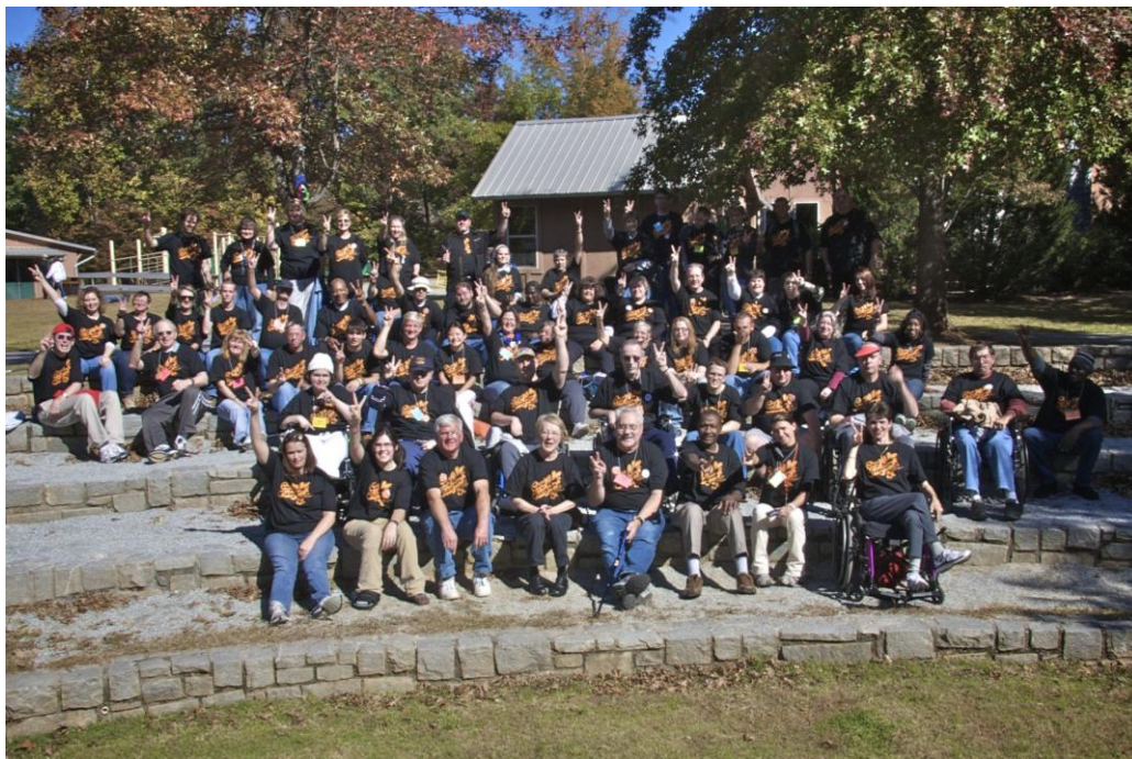
2008 CAMP HARDGROVE CAMPERS

Waring is still putting together a slide show of the event to be sent to the Support Groups. If you were in attendance, took photographs, please email them to wij1@bellsouth.net .