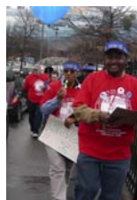
Marching to event