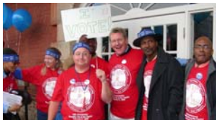
Seminole Spirit Support Group