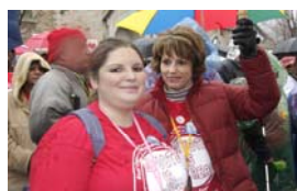
A mothers look of love