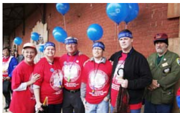
Newton/Rockdale Support Group