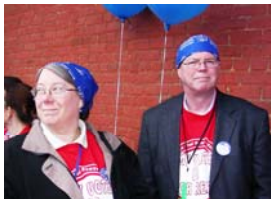
Athens Support Group