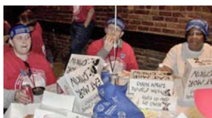
Emory Support Group