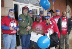
Veterans with other group members