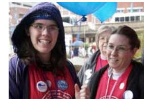
North Ga Support Group