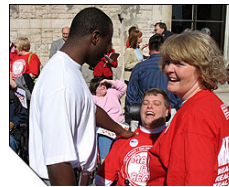
Disability Day 2007-Atlanta Falcons quarterback D.J. Schockley

"LET'S MAKE OUR PRESENCE AND VOICES BE HEARD AS A UNIFIED GROUP!!"