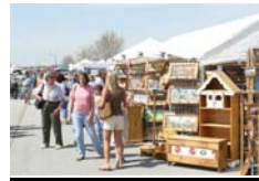
Festival Photo from past events at Conyers, GA